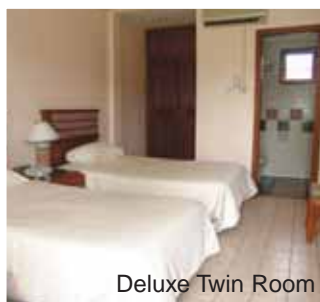
Deluxe Twin Room

BONUS: Breakfast included daily. Guaranteed Upgrade from Superior to Deluxe room (Not valid 20 Dec 08-20 Jan 09). Stay 7 nights Pay for 6 (Not valid 20 Dec 08-20 Jan 09. Breakfast is charged on FREE night).