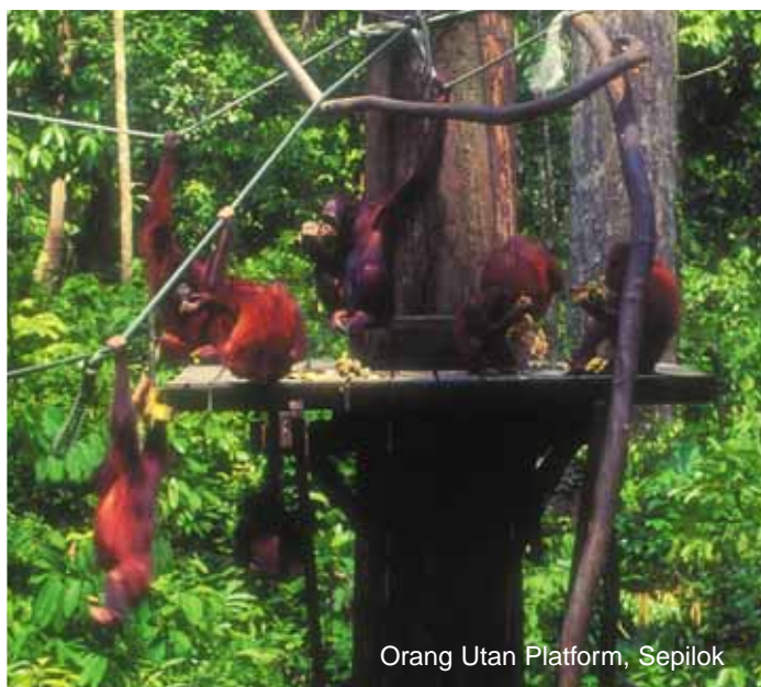
Orang Utan Platform, Sepilok

Note: Recommended flight to join this tour in Sepilok is MH2042 departing at 7.30am from Kota Kinabalu to Sandakan.