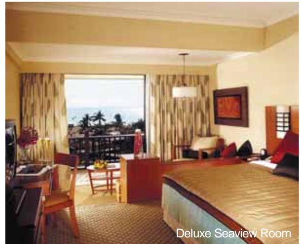
Deluxe Seaview Room