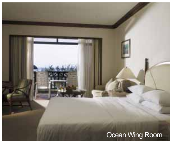
Ocean Wing Room