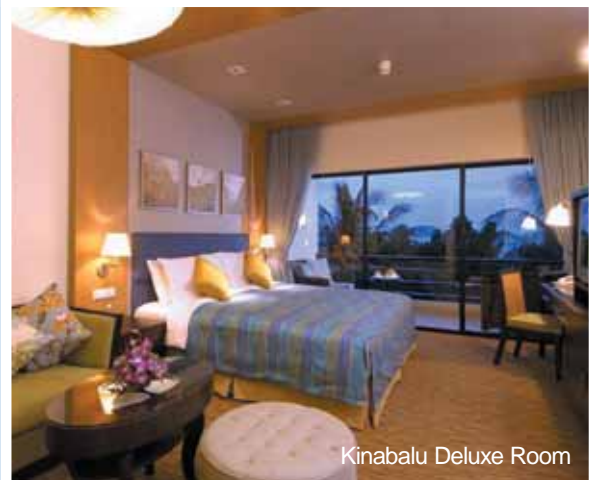
Kinabalu Deluxe Room