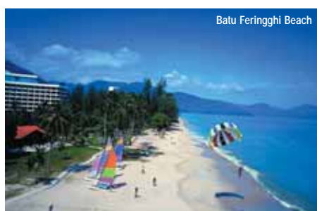
Batu Feringghi Beach

For tours ex Singapore, the pick-up time will be approximately 0700-0730 hrs. You will be advised prior to departure the actual pick-up time prior to commencement of tour, 1 day before by our local agent.