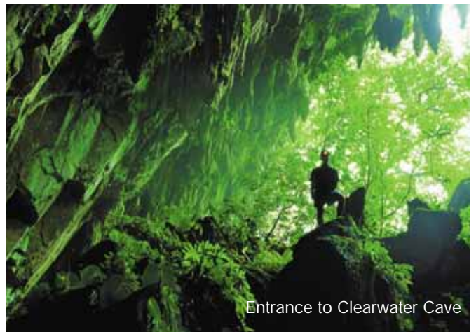
Entrance to Clearwater Cave

Note: The trekking on this tour is quite tough, involving an average of 7km treks per day. Clients must be physically fit & mentally prepared.