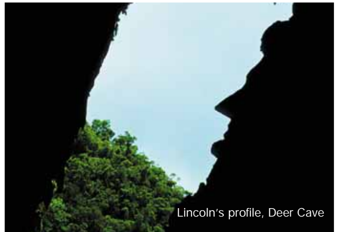
Lincoln's profile, Deer Cave

Price includes domestic airfares from Kuching to Kota Kinabalu & Kota Kinabalu to Sandakan and return. Price excludes taxes.