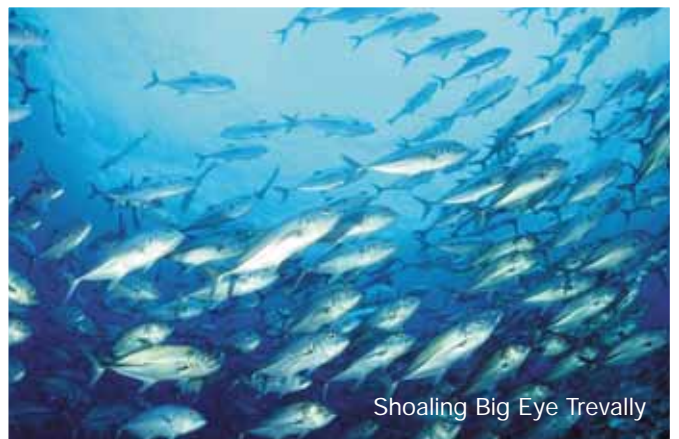
Shoaling Big Eye Trevally