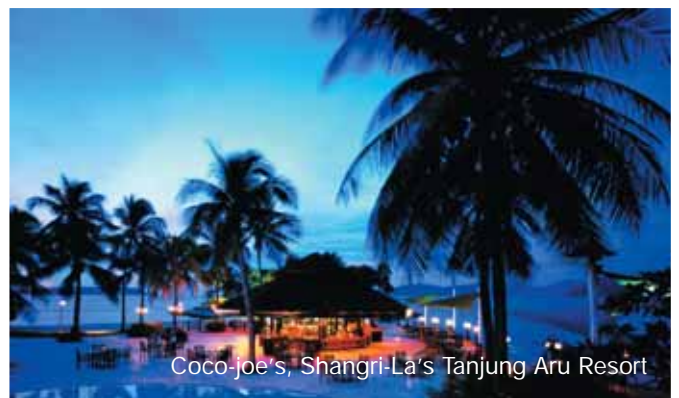
Coco-Joe's, Shangri-La's Tanjung Aru Resort