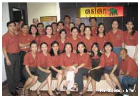
Ho Chi Minh Team