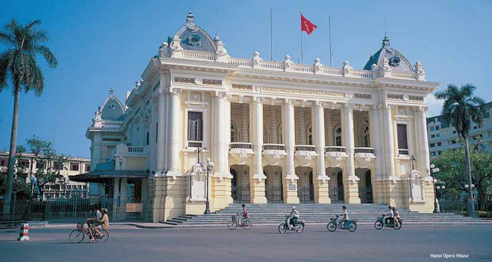
Hanoi Opera House