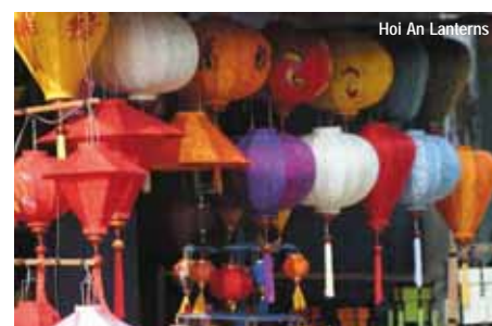
Hoi An Lanterns