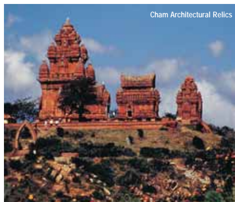
Cham Architectural Relics